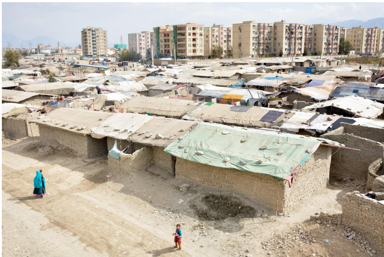
Photo 1: One of the informal settlements included in this study.