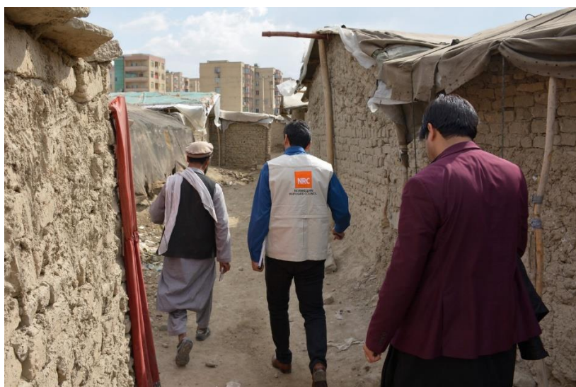
Photo 2: NRC research team members are accompanied in one of the informal settlements by an displaced community representative.