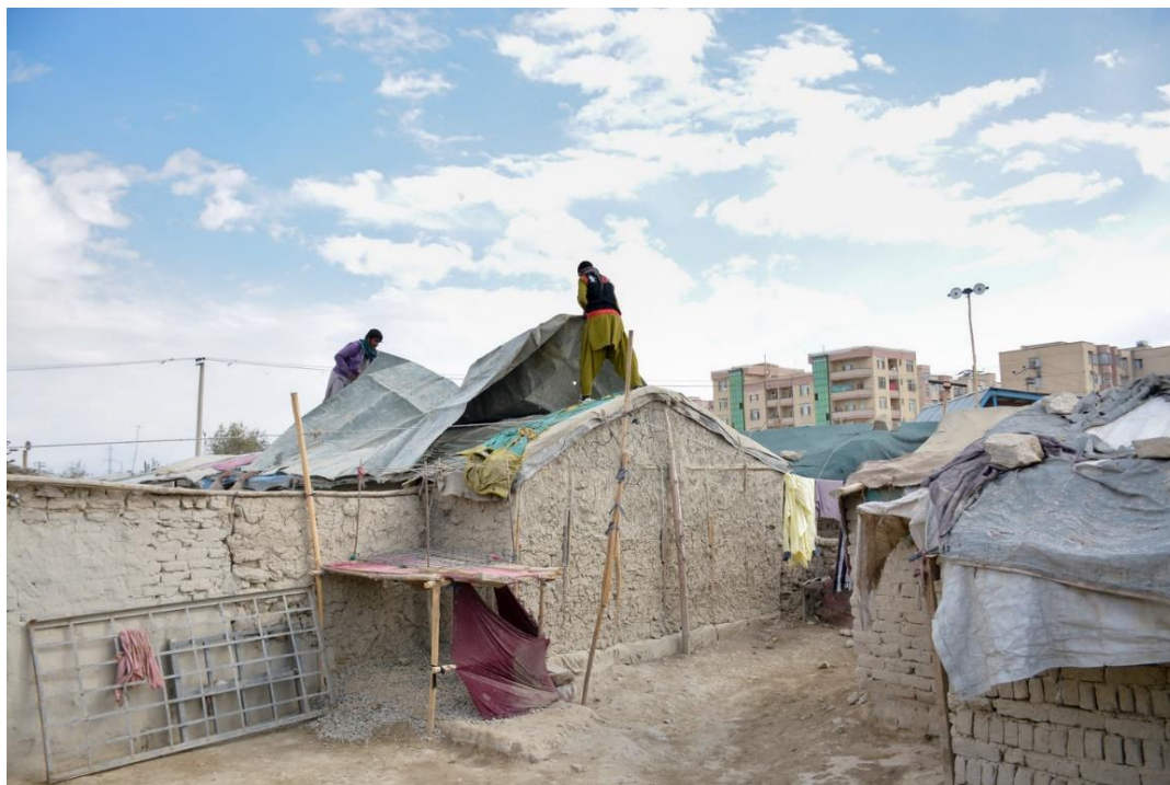
Figure 4: Men in one of the informal settlements fixing extra tarpaulins to the roof of their shelter, ahead of the winter rain and snow.

The situation is different for the residents of Site 1, which is on the outskirts of the city and has been purchased by the residents. Due to their ownership of the land (at least in the eyes of the land seller), they are able to build permanent shelters and infrastructure in the site, and to receive support from NGOs to make improvements. For example, they have managed to obtain a school building and teachers, and a water network.