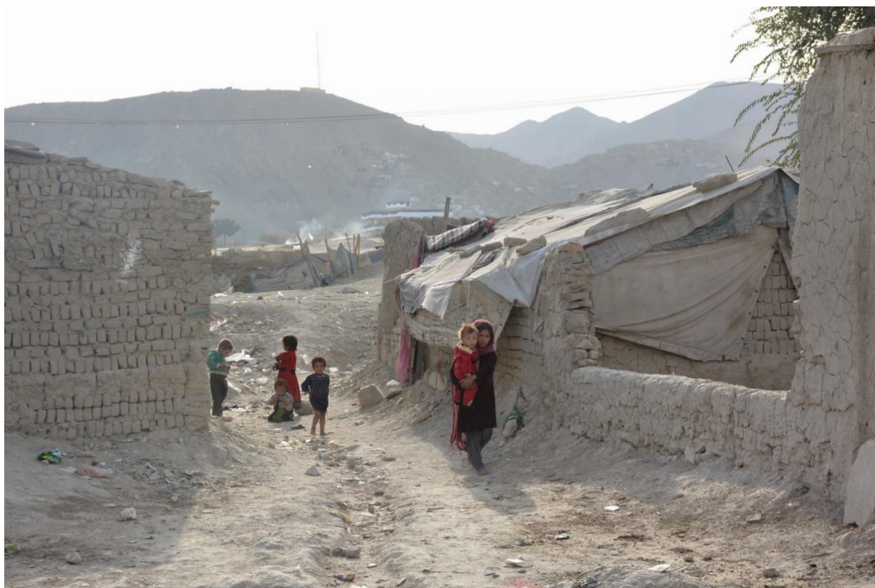
Figure 3: Displaced children in one of the informal settlements.

In Site 3 the residents consulted in NRC's research said they are paying rent to a number of different men (between $4.5 and $9 per household per month) who claim to own different parts of the land, but none of them knew of any written tenure agreement. They have not asked for a written agreement, but they agree that it would be important to have one. Meanwhile, the KIS Taskforce Profiling exercise – which surveyed all residents at the time of data collection – found that 54% of residents in the wider settlement 12 had a “rental agreement”, while 18% had “customary tenure”, 26% did not know, and one per cent claimed to have a letter from the government. The residents consulted in the NRC research described one of their landlords as “a tough and rigid man. He visits us every month, right at the last day of the month, to collect the rent. If someone delays the payment, he gets angry. In the past, he sometimes demolished walls surrounding shelters because the rent was delayed”. The male residents believe that the alleged landowner does not have documents to prove his ownership, and that he has illegally appropriated the land: “we think he is a land grabber”. The research team was able to speak to one of the landlords, who